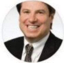
John McLaughlin @jmcldghln